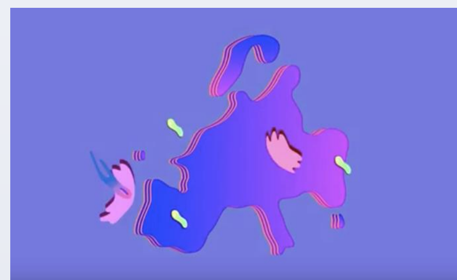
POTO 3. The official logo of the platform Cultural Gender Practices Network ( www.gendernet.info )