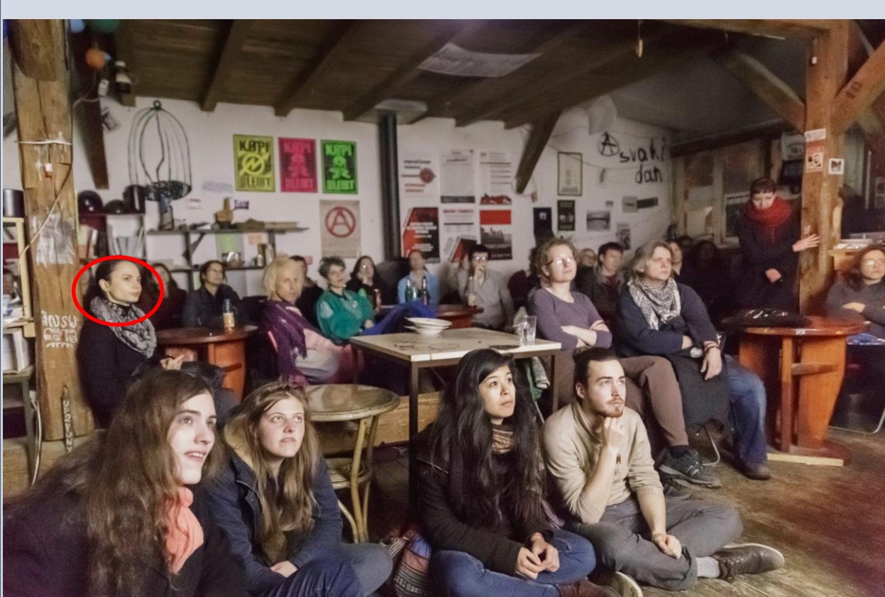
PHOTO 2. Participating in a video-screening during Ljubljana based festival ( Rdece Zore ) (2015)

This study is a part of my doctoral thesis which uses feminist festivals as an analytical prism for contemporary post-Yugoslav feminist movements. This comparative study of festivals builds upon the conceptual framework* of social movements theories and sociology of gender. Classical and digital ethnographic methods as well as archival work has been used to collect data (2015-2017)**.