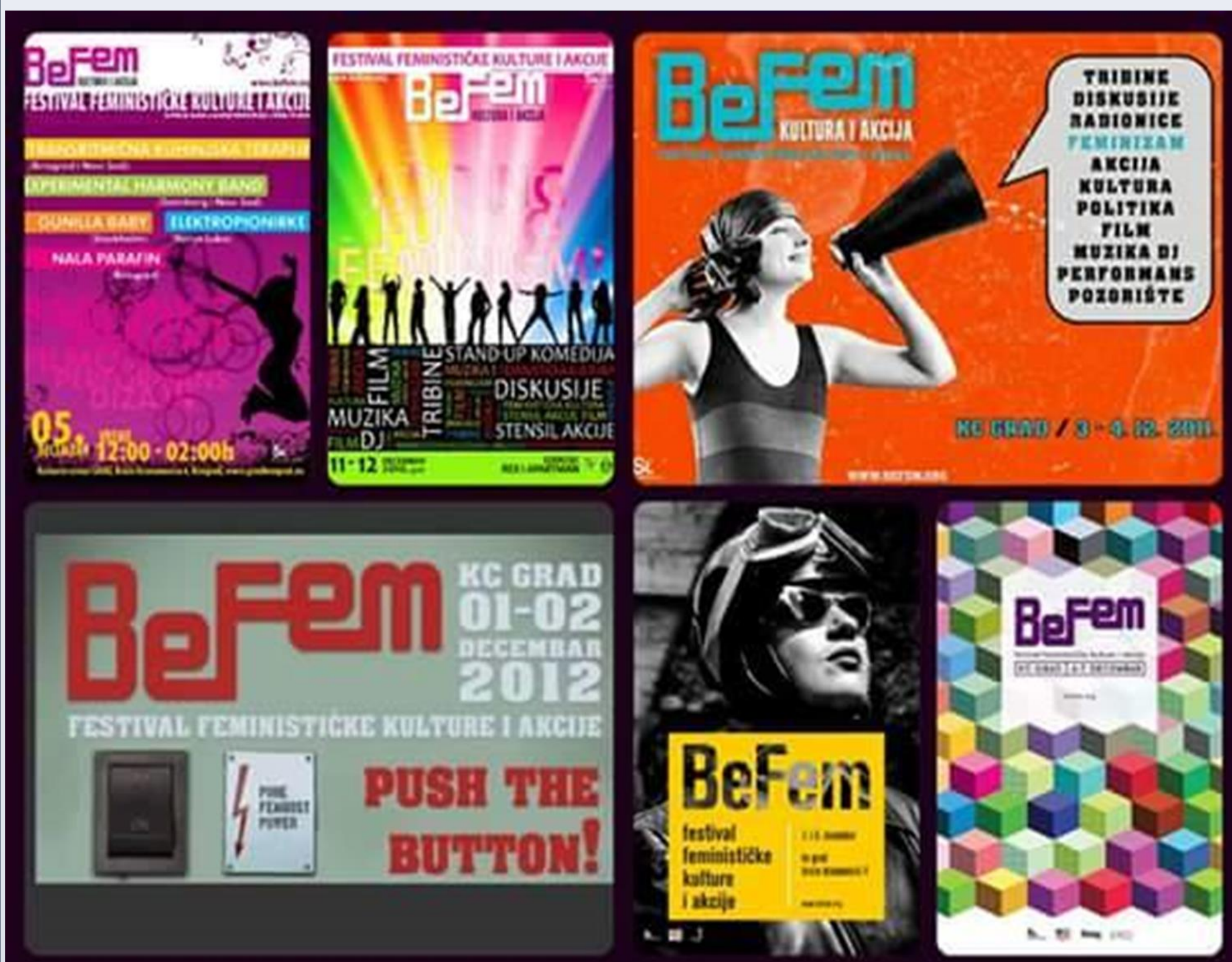
PHOTO 1. The collection of posters for the Belgrade based festival ( BeFem ) (2009 - 2015).

The study questions how do festivals manage to preserve the transnational organizing despite intra-regional diversity?