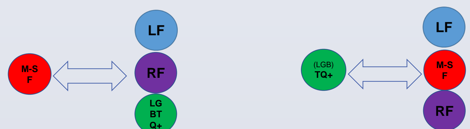
FIGURE 1. M-S F- Marxist/Socialist; LF – Liberal; RF – Radical; LGBTQ+ - Lesbian, Gay, Bisexual, Trans*, Queer